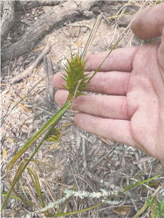
Carex lupulina (Hop sedge)