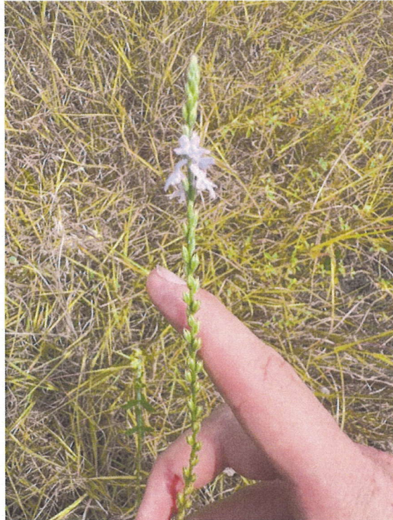
Verbena xutha (Gulf vervain)