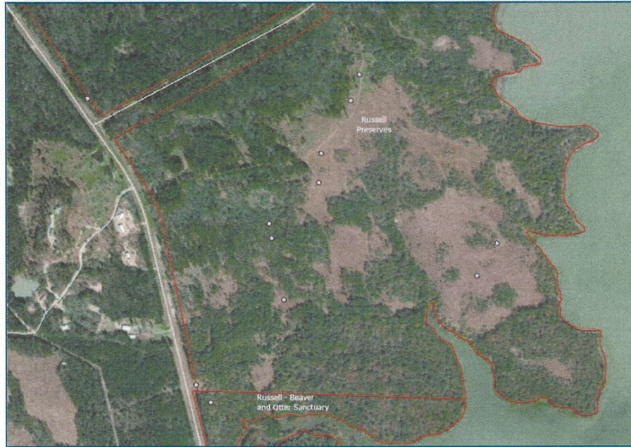
Figure 2: Map of points at Russell preserve prairie tract and beaver and otter sanctuary.

On the northern half of the preserve sits an intact calcareous prairie (fig.4) whose boundaries are evident from where the tree line begins. In this unique system, we can find a vast diversity of warm-season bunchgrasses like little bluestem ( Schizachyrium scoparium ), Indiangrass ( Sorghastrum nutans ), silver bluestem ( Bothriochloa laguroides ), and big bluestem ( Andropogon gerardii ) intermixed with other associated herbs including black-eyed Susan ( Rudbeckia hirta ), snow on the prairie ( Euphorbia bicolor ), beebalm ( Monarda punctata ), prairie tea ( Croton monanthogynus ), and common ragweed ( Ambrosia artemisiifolia ). Patches of yellow bluestem ( Bothriochloa ischaemum ) can occasionally be seen but remain more limited in its distribution. Woody cover is sparse (<5%) to non-existent where observed and often does not grow beyond the size of a pole tree due to shallow soil conditions. Since this prairie was surveyed in August 2025 (or post flowering season), it is important to note that this community is likely to experience drastic seasonal variation in its floral composition.