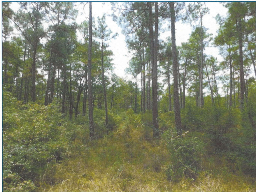
Figure 6: Open pine forest with yaupon dominated understory.