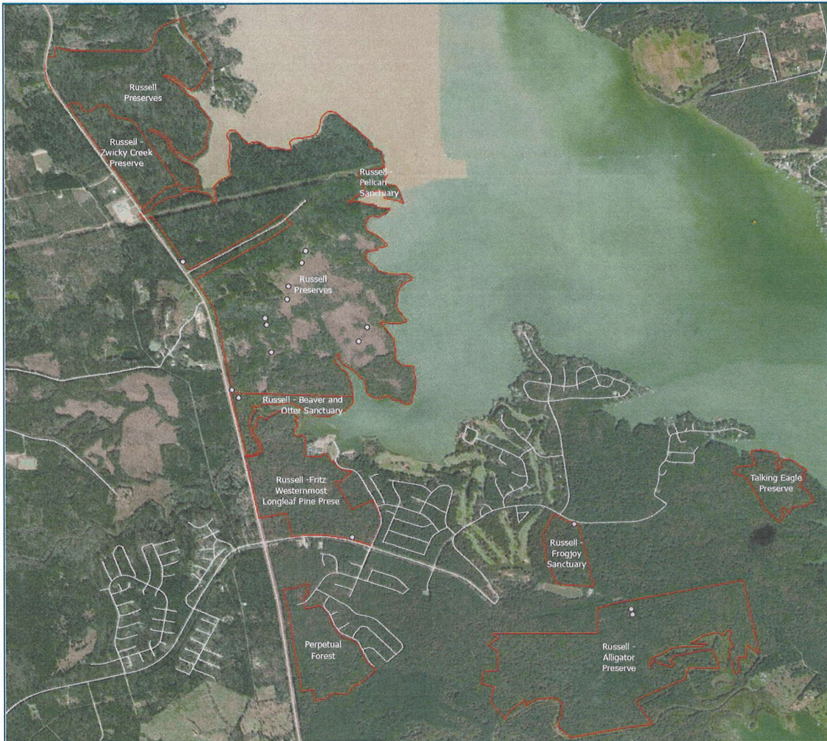
Figure 1: Site map of Russell preserve.