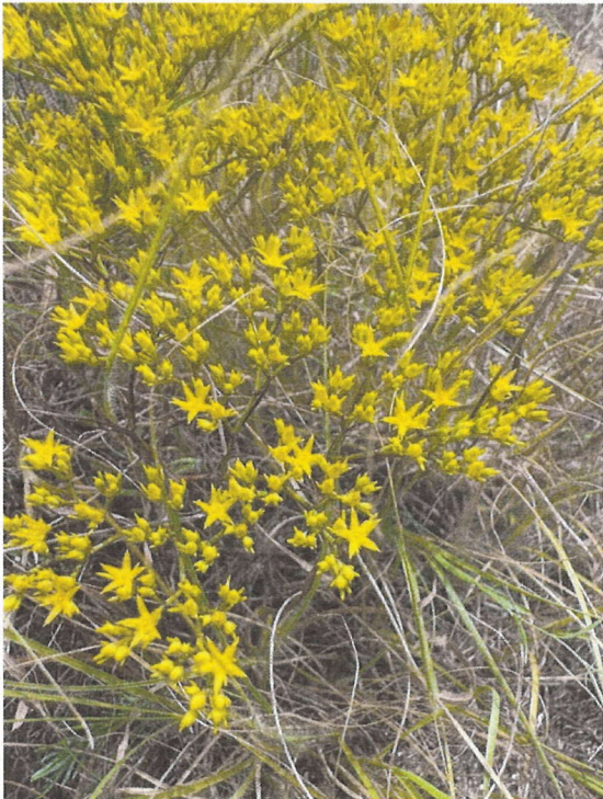
Paronychia virginica (Virginia whitlow-wort)