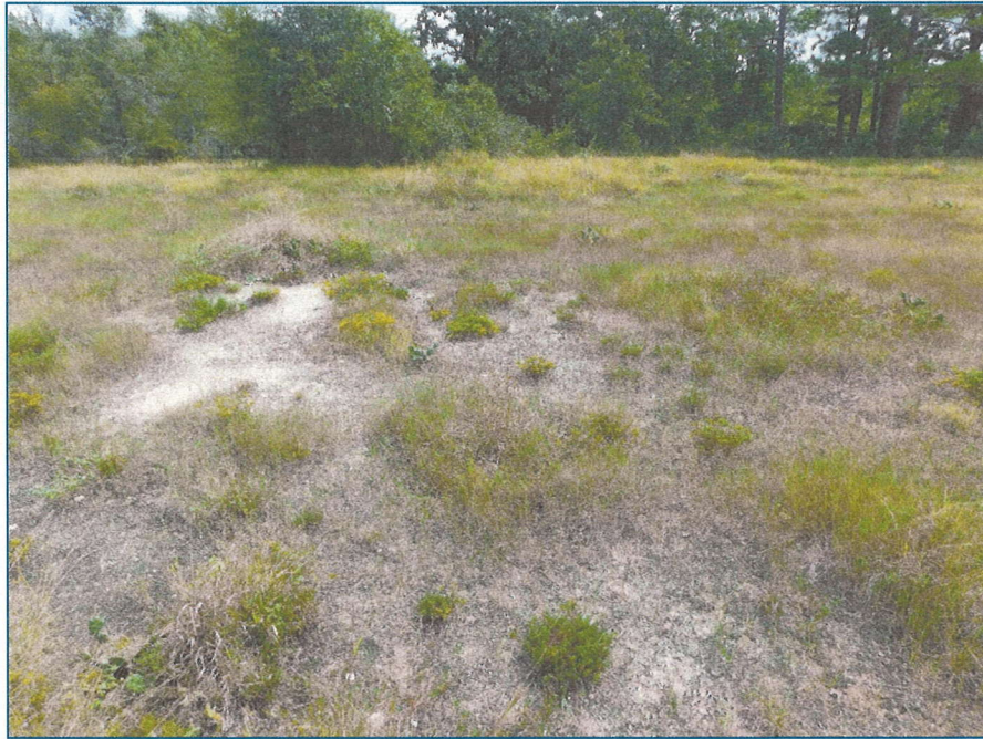
Figure 5: Catahoula barrens.

( Paronychia virginica ), plains lovegrass ( Eragrostis intermedia ), compact prairie clover ( Dalea compacta ), and narrowleaf gumweed ( Grindelia lanceolata ). These communities remained relatively sparse across the property and often did not exceed 30 m 2 in size.