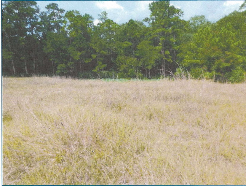
Figure 3: Fleming Prairie inclusion.