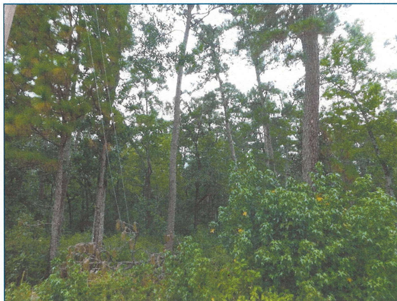
Figure 9: Longleaf pine forest.