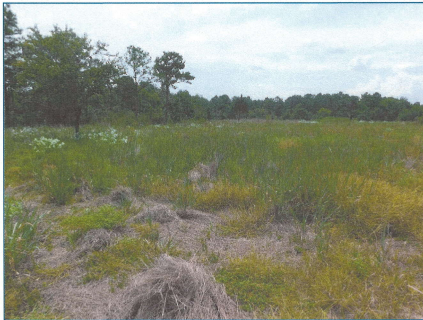
Figure 4: Southern Calcareous Mixedgrass Prairie.

Small 'Catahoula' barren inclusions (fig.5) can be observed near the edges of the larger prairie, which are represented by thinner loam soils with an underlying sandstone bedrock. Herbaceous cover varied extensively (50-75+%) but always exhibited some degree of bare ground exposure. Trees and shrubs remain limited in their ability to persist with only few species of prickly pear ( Opuntia spp. ) present. Herbaceous cover shared some species overlap with adjacent prairies areas, but also displayed hardier sandy groups adapted to endure xeric conditions like threeawn ( Aristida spp. ), Virginia Whitlow-wort