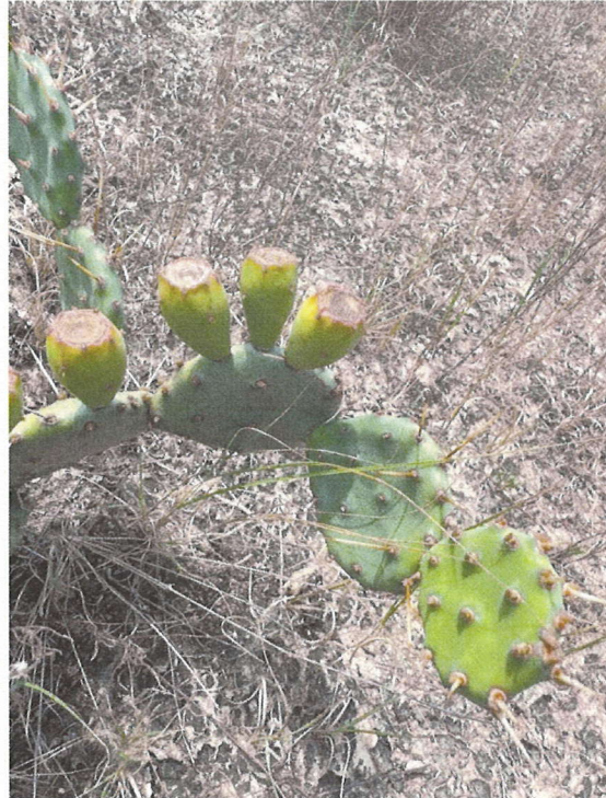
Opuntia humifusa (Low pricklypear)