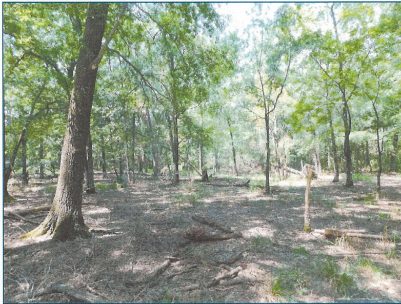
Figure 8: Hardwood flatwood.

Just west of the flatwood areas described exists another noteworthy community within the Longleaf Pine Preserve tract where one can observe managed mature stands of longleaf pine ( Pinus palustris ). Aside from this predominant species, these woodlands can range in different pine and hardwood species including different oaks ( Quercus spp. ), American sweetgum, yaupon holly, and American beautyberry depending on the conditions present. Herb cover is generally more limited due to the density of woody species but includes slender woodoats, prairie blazingstar ( Liatris pycnostachya ), thinseed paspalum ( Paspalum setaceum ), and purpletop tridens ( Tridens flavus ).